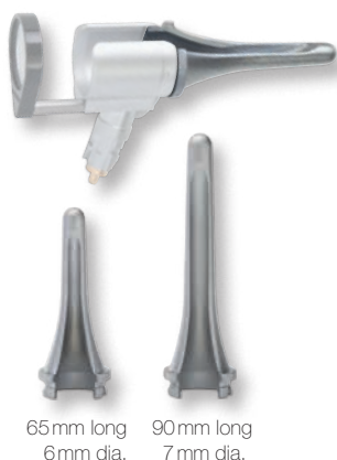
65 mm long 90 mm long 6 mm dia. 7 mm dia.