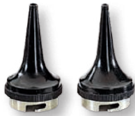
2.8mm dia. 2.2mm dia.