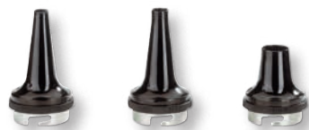
4.5mm dia. 5.5mm dia. 10mm dia.