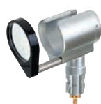
Slit Illumination Head