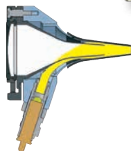
Fiber Optic (F.O.) illumination

Solid, all-metal construction. A quality instrument for the Vet's office with Fiber Optic (F.O.) illumination. Insufflation port. The swivel window features an airtight seal.