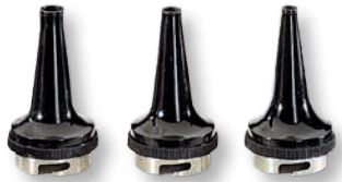
5.5mm dia. 4.5mm dia. 3.5mm dia.