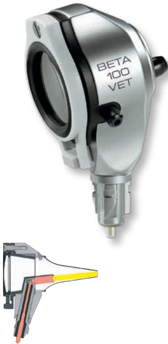
Direct Xenon Halogen illumination

Otoscope with all-metal construction and direct Xenon Halogen illumination. Suitable for use with short, closed specula. With the use of the VET adaptor (G-000.21.214), it is possible to fit reusable VET specula for ear examinations.