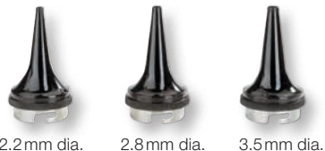
2.2mm dia. 2.8mm dia. 3.5mm dia.