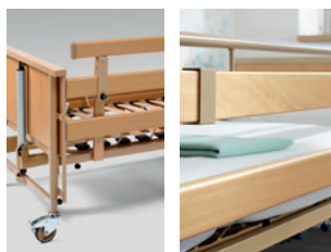
Left: clip-on safety side rail Right: turnable handrail