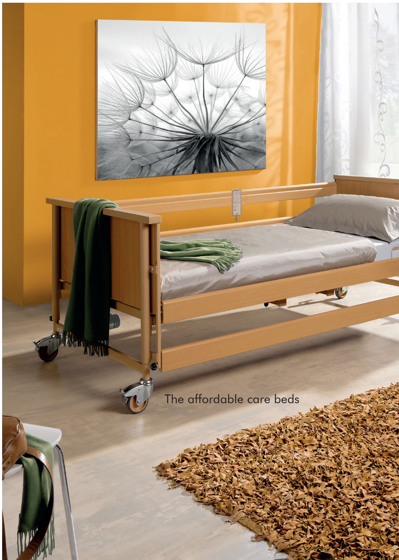
The affordable care beds