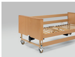
Wooden panels for the chassis (also for retrofitting)