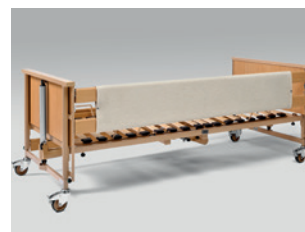
Foam leather cover