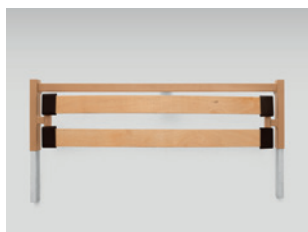
Bed extension (also for retrofitting)