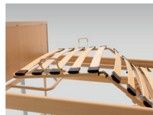
Lower leg rest can be raised with a rastomat (also for retrofitting)