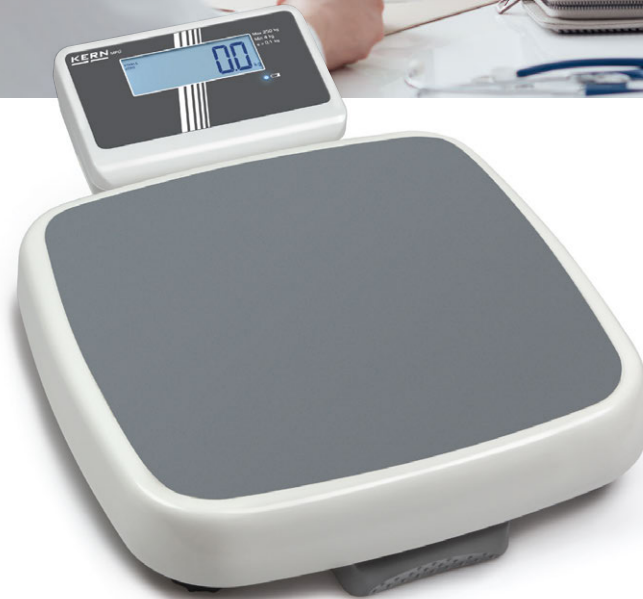
KERN MPD 250K100M